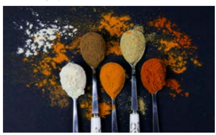
TRBOCALL - GREATER THAN THE SUM OF ITS PARTS

Kerry Foods wanted a smartphone device that could be used in harsh environments, withstand being dropped, track the location of workers in real-time, and give them two-way radio like capabilities — in the form of instant communication via dedicated Push To Talk (PTT), group calling, and dedicated emergency buttons.